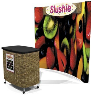
Stratus table with optional casters for easy positioning and custom graphic panel. Casters add 3" (7.6 cm) to total height.