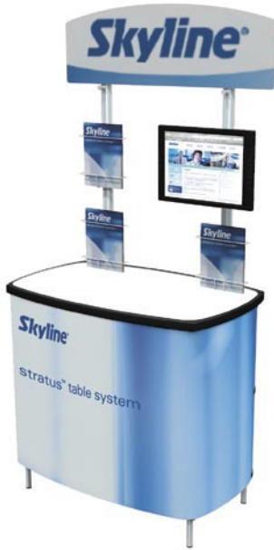
Two accessory poles allow for multiple accessories and a graphic header.